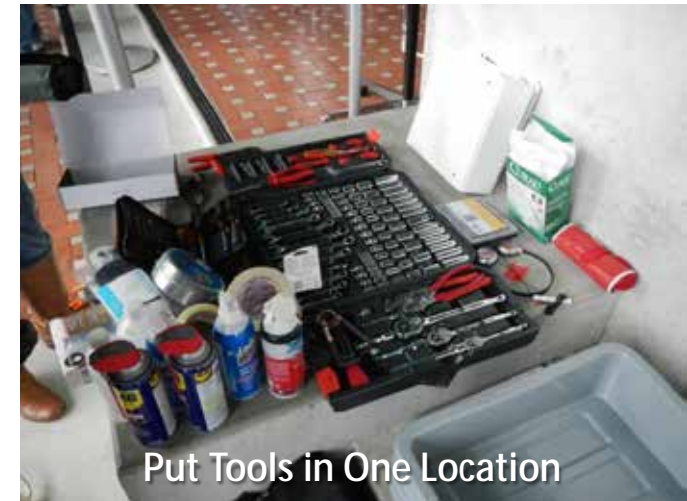
Put Tools in One Location