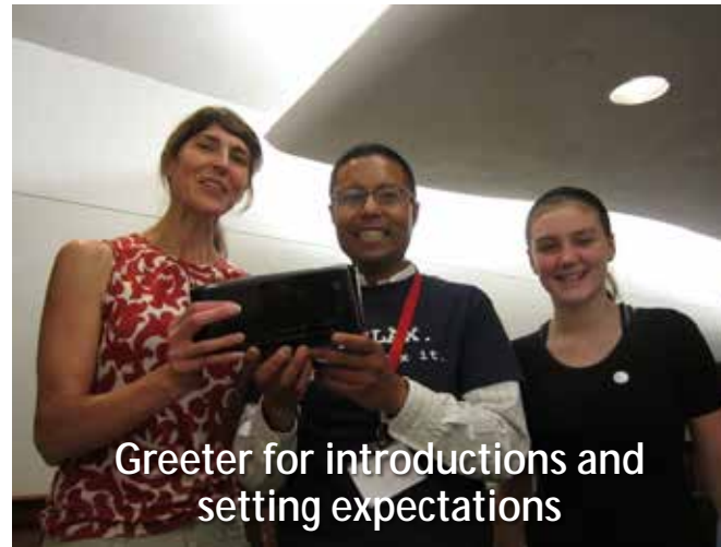
Greeter for introductions and setting expectations