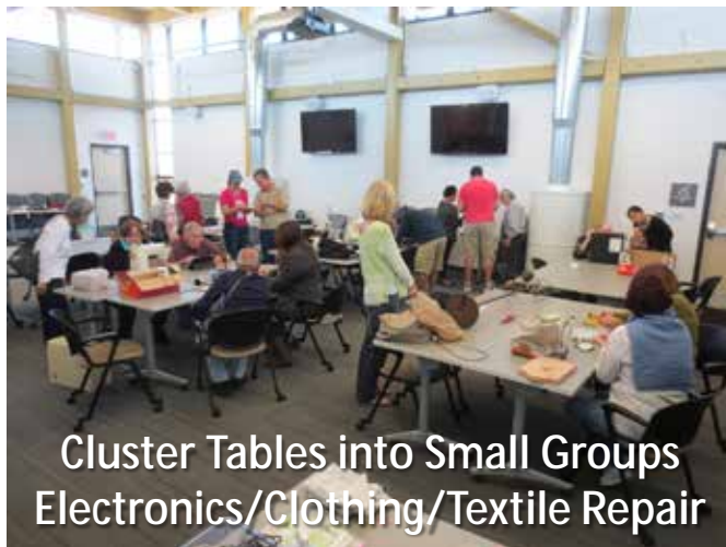
Cluster Tables into Small Groups Electronics/Clothing/Textile Repair