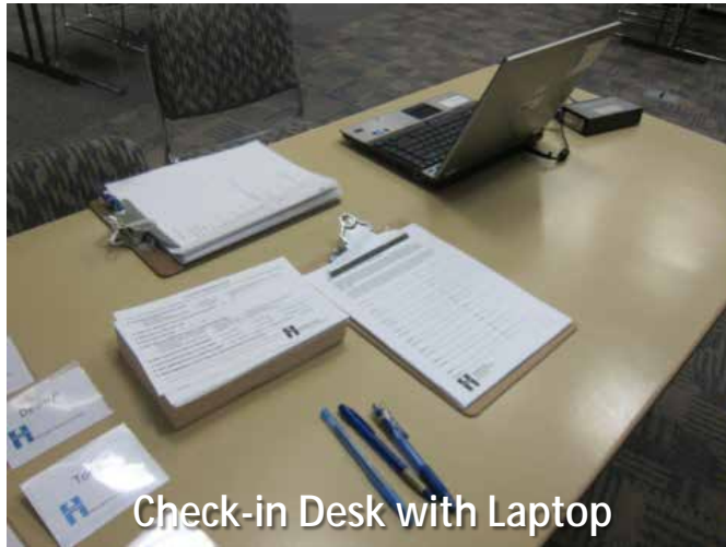
Check-in Desk with Laptop