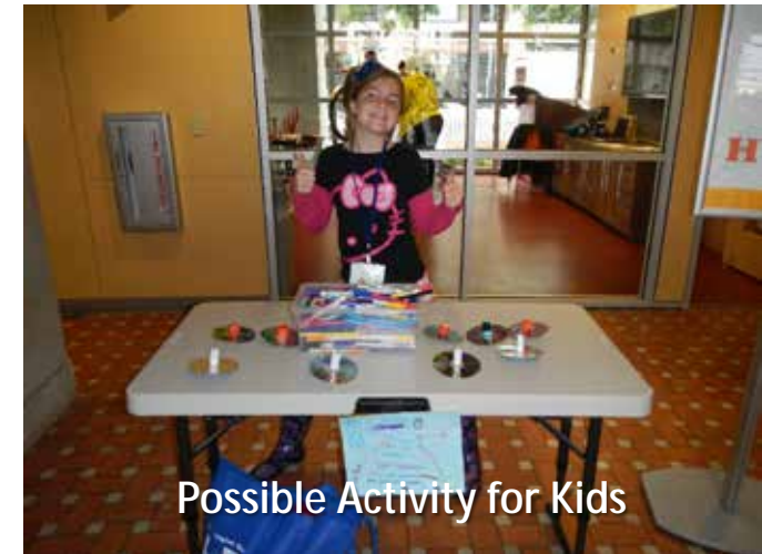
Possible Activity for Kids