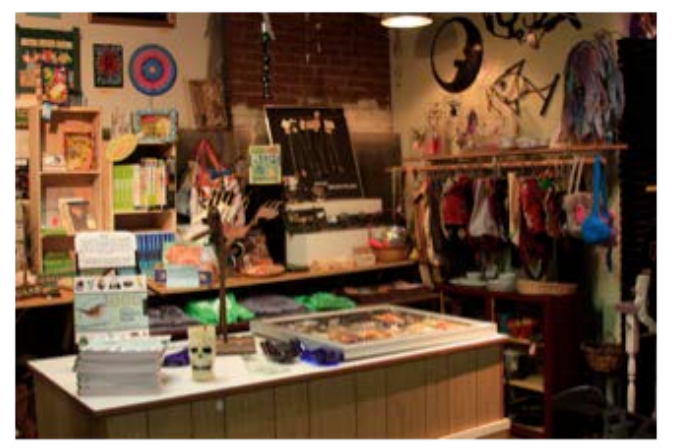
founded 1991 501c3 non-profit

Mission: to promote creativity, environmental awareness and community through reuse.