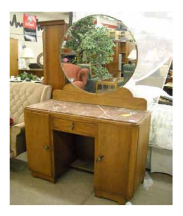
From Brussels, Belgium