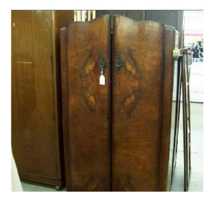
From Doncaster, England